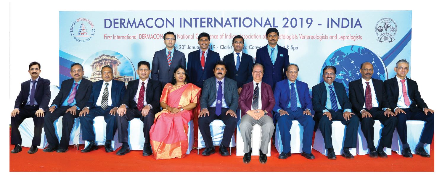
Organising Core Committee